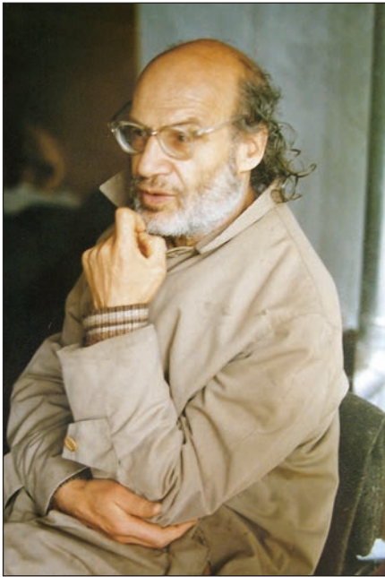
Grothendieck in May 1988.

Many people who know Grothendieck report that he has “always” been very interested in dreams. But they became the central theme of his thinking only after the “great turning point” of 1970. It appears that he thoroughly worked through, for example, Freud’s Traumdeutung ( The Interpretation of Dreams ) and also read other relevant literature. 9 On the other hand, he does not describe even a single one of his own dreams that had great importance for him, and he says nothing about how he analyzed them.