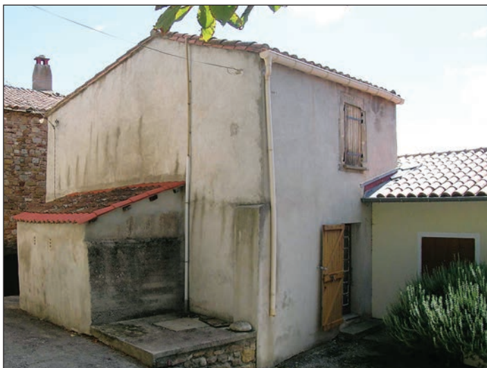
Grothendieck's house in Villecun, where he lived from 1973 to 1979.

Le Chambon. (The great story of Le Chambon has been the subject of many documentaries, novels, and movies. 3 ) In Le Chambon, Grothendieck was able to attend the Collège Cévénol, an international private school founded by Trocmé, which from the beginning was dedicated to nonviolence and the solidarity of all people—not popular ideas in a time of war. In 1945 Alexander completed there his rather chaotic schooling with the baccalauréat .